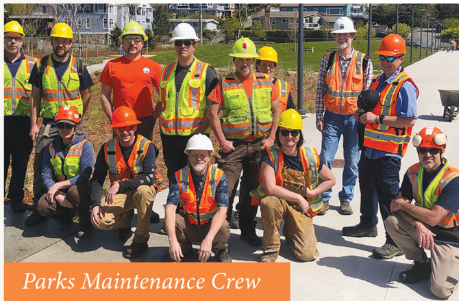
Parks Maintenance Crew

These dedicated City staff members deserve our praise and thanks, so when you’re out and about seeing these folks hard at work, show them your gratitude with a wave, smile or hello! ■